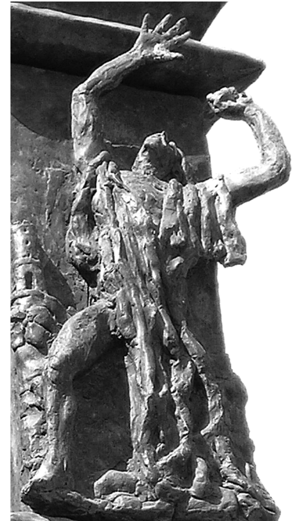
Jeremiah laments at the destruction of Jerusalem: Detail from the Knesset Menorah, Jerusalem.